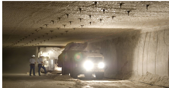
Underground at the Waste Isolation Pilot Plant

Screenings will build upon WHPP's experiences examining over 30,000 DOE workers from other facilities and may include a chest X-ray, hearing test, breathing test, audiometric exam and blood tests. There is also a general health component of the